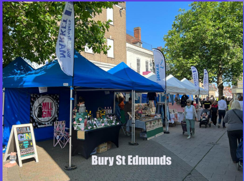
Bury St Edmunds